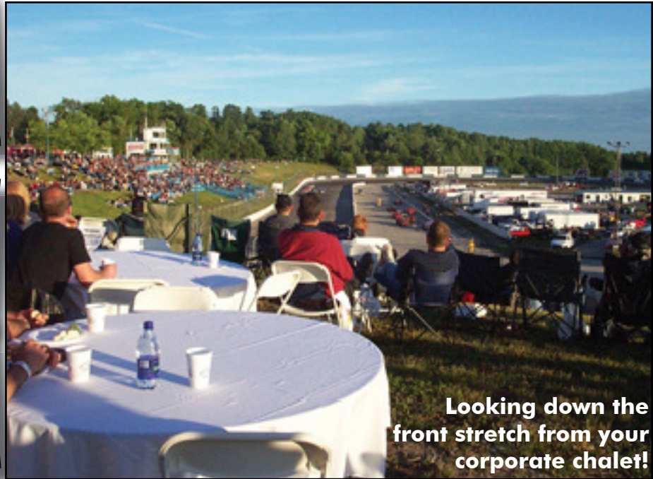
Looking down the front stretch from your corporate chalet!

Treat your employees, customers and clients to an exclusive, unique and fun experience: a corporate hospitality chalet at Delaware Speedway! With an attentive staff at your service, you can focus on visiting with your guests while they enjoy a memorable experience in a unique environment they're sure to appreciate.