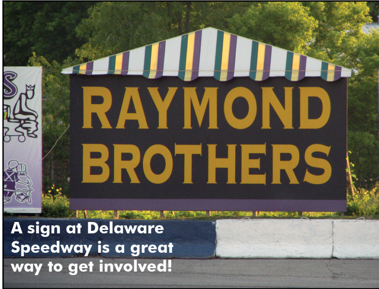
A sign at Delaware Speedway is a great way to get involved!